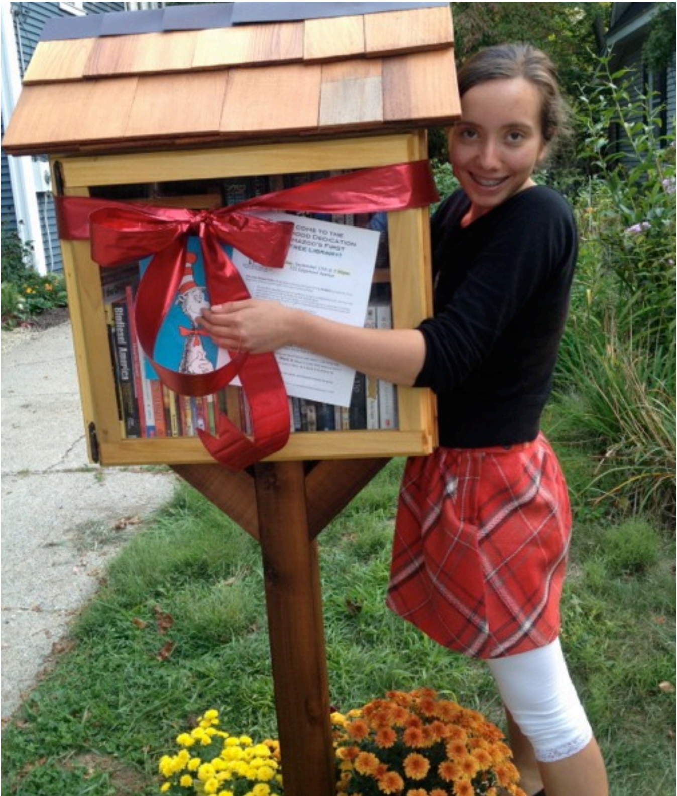
Kalamazoo Little Free Library Plans